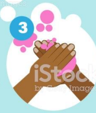
BACK OF HANDS