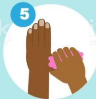
BASE OF THUMB